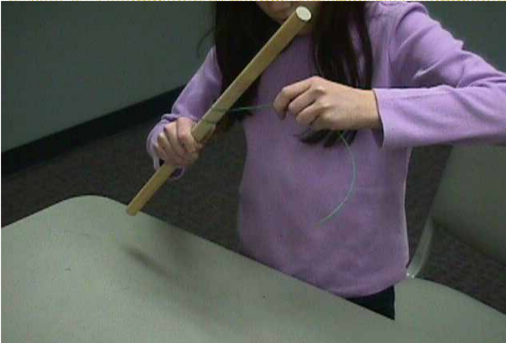
Making curved lines with wire and dowel