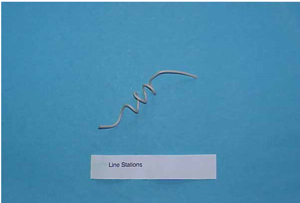
Finished curved line with wire